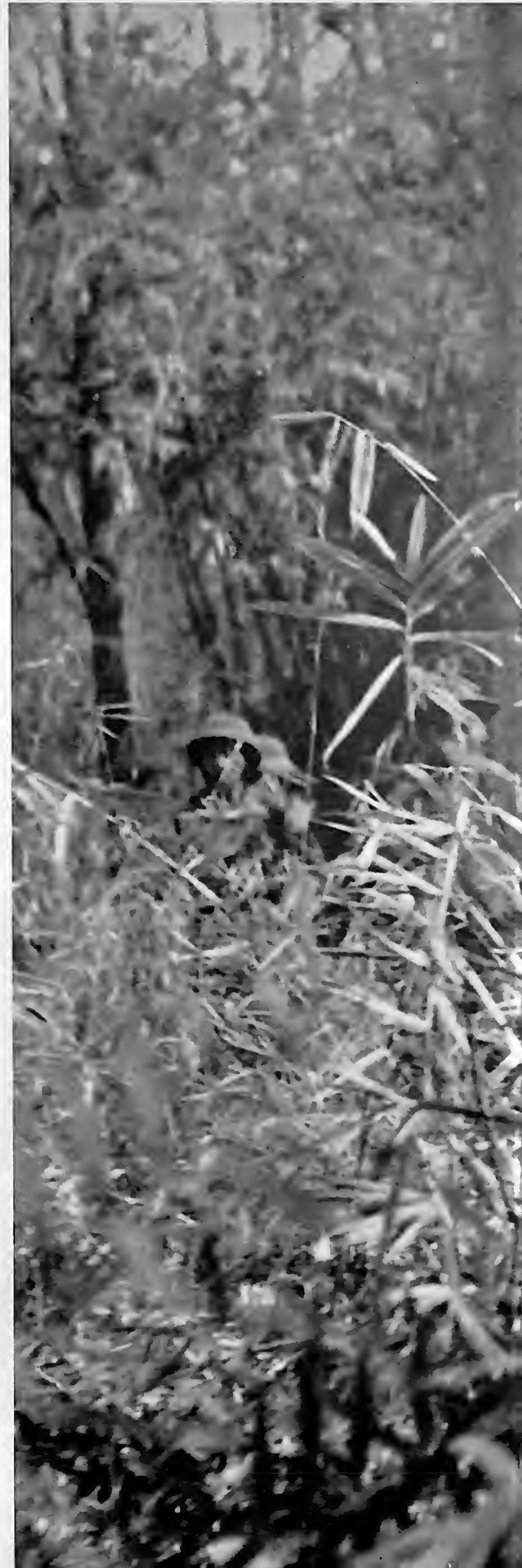
Heading for a campsite near Cambodia.